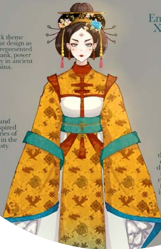
Empress Xiaozhen Xianhuanghou

Headpiece and accessories inspired by the accessories of the empresses in the Qing Dynasty