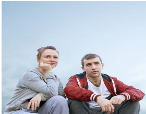
Romeo and Julie; Trailer

This term the focus will be exploring a modern version of Romeo and Juliet and visiting the Half Moon Theatre, its amazing backstage area which makes the magic happen for the audience. Children found our information about a range of careers in the performing arts, (not necessarily performing), they can aspire to.