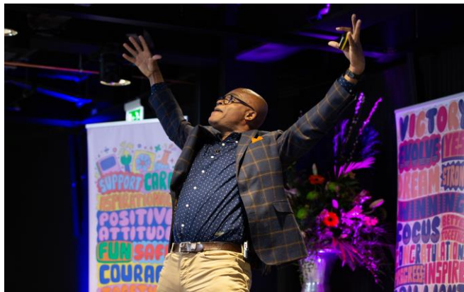
Kriss Akabusi MBE: Our Motivational Speaker 2023

The awards were held at the Headquarters of BT an inspirational setting. There can be no rehearsal for the awards; children come from over one hundred schools UK- wide and we want them to shine.