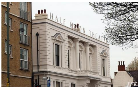
Half Moon Theatre

If your young person is interested in getting involved and is in years 9,10 or 11, we'd love to hear from them!